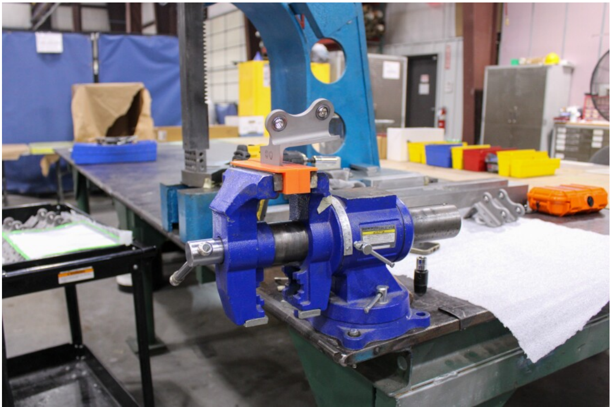
Etezazi Industries manufactures parts for Boeing, Airbus and other planemakers.

“We’re coming to the conclusion that (their price expectations are) coming from outside the U.S.,” he said.