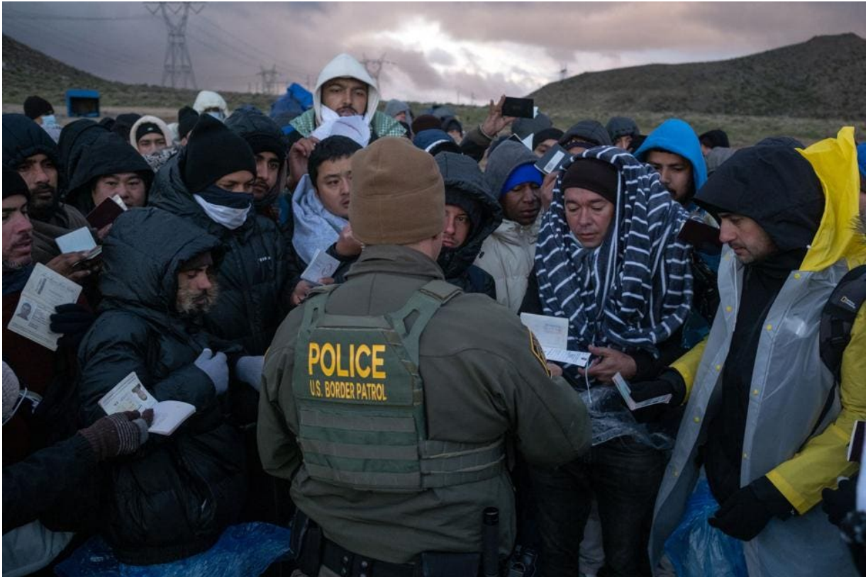
Asylum seekers rush to be processed by border patrol agents at an improvised camp near the US-Mexico... [+]

The more that business leaders understand about a crisis that can impact their companies and organizations, the better. Two recently published books about the history and people-related aspects of the immigration crisis provide fresh insights and perspectives about this hot-button issue.